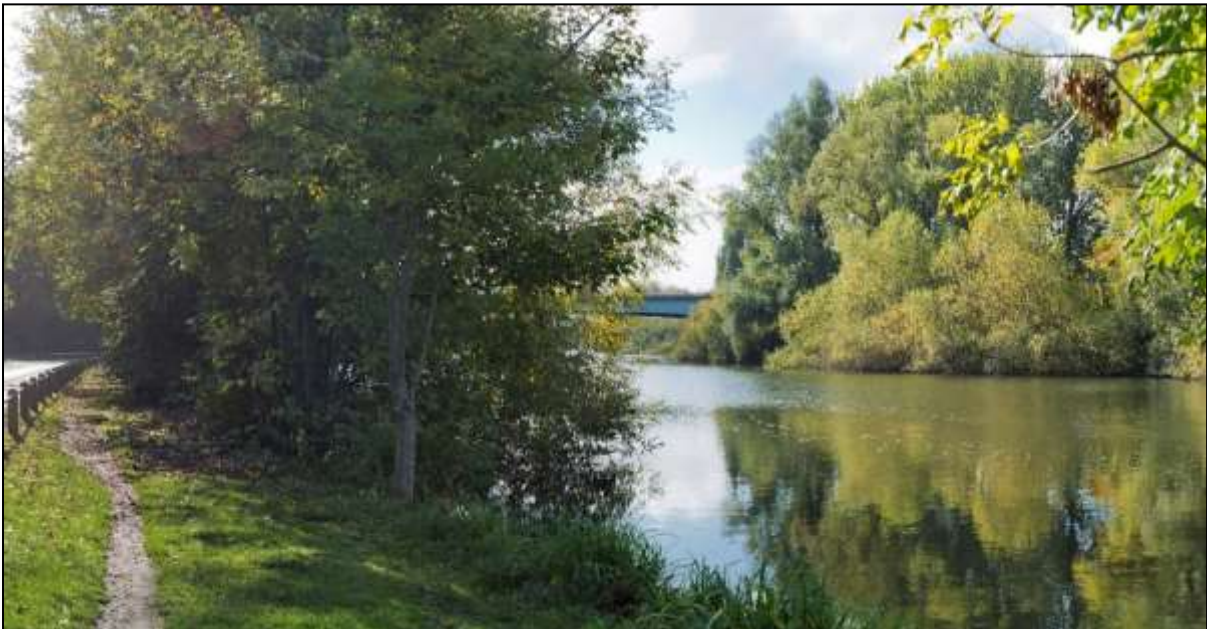
View of the River Thames at Laleham Park looking south towards the M3 crossing